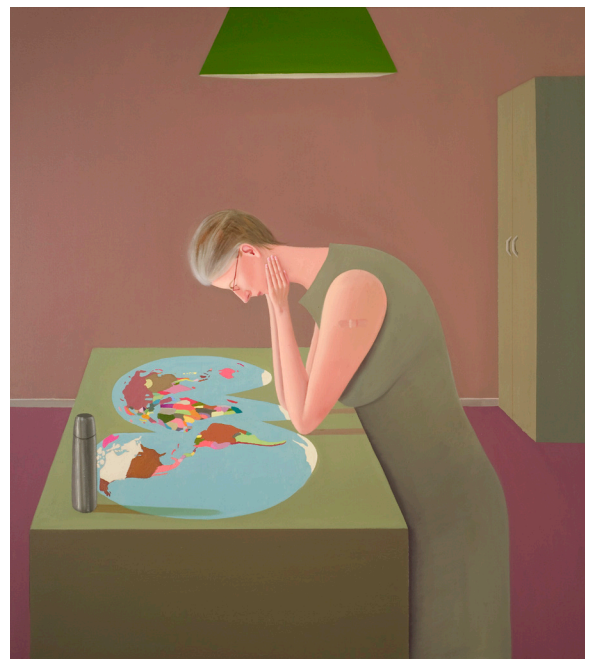
World map, 2009, oil on linen, 122 x 109cm

For images and further information please contact: olivia@nelliecastangallery.com