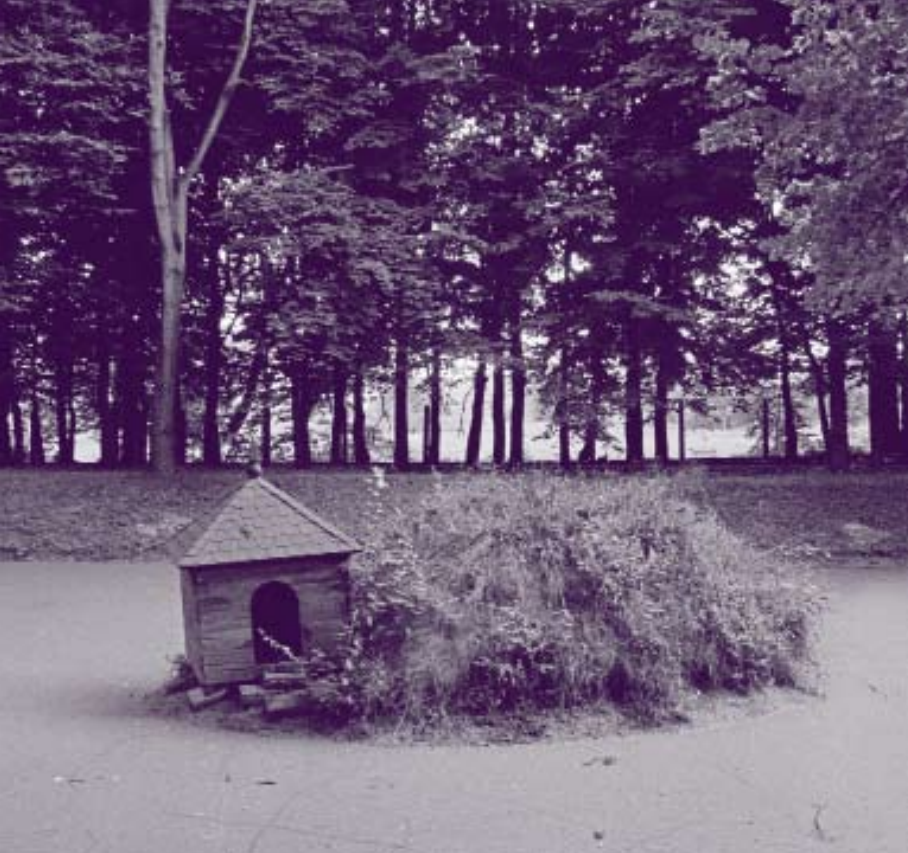
Izabela Pluta, Untitled (Float) , 2009, photo mural on adshell paper, 212 x 310 cm